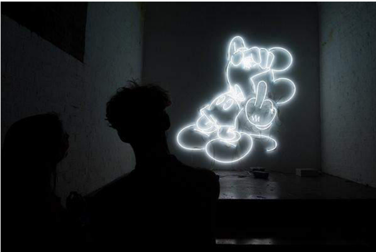
Famed, Free Your Soul , 2016